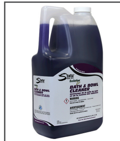
Ecolution Pro® Bathroom & Bowl Cleaner Green Certified Bathroom Cleaner