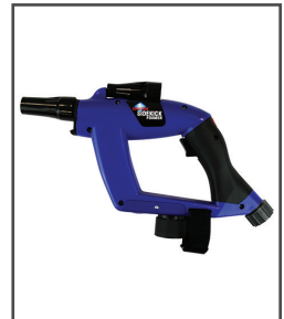
One Solution™ Sidekick Foamer Portable Foam Cleaning System