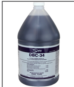
DBC-34™ Concentrated Disinfectant and Bathroom Cleaner