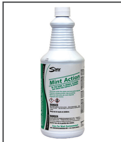
Mint Action™ Bowl and Urinal Cleaner