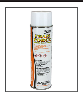
Foam Force™ No-Vacuum, Foaming Carpet Deodorizer