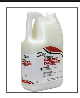
Ecolution® Carpet Cleaner Safer Choice Certified 3-in-1 Carpet Cleaner