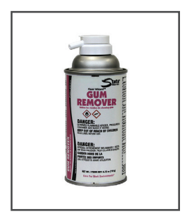
Gum Remover ™ Aerosol Gum and Goo Remover