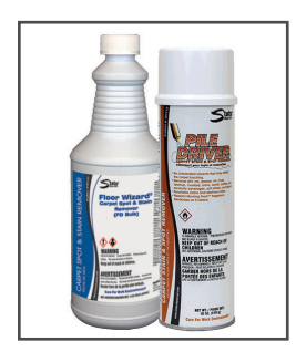
Pile Driver ® Carpet Spot and Stain Remover