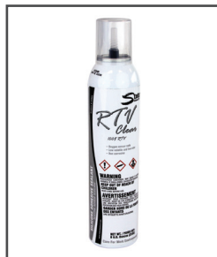
RTV™ Silicone Adhesive/Sealant/ Caulk/Gasket Marker