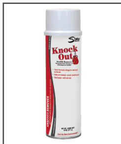
Knock Out™ Aerosol Graffiti and Soil Remover