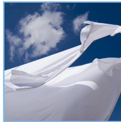
Fresh Abscent™ Clean Cotton Crisp Linen Fresh Linen Morning Fresh™ Paradise Breeze