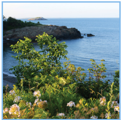
Aromatic Coastal Dreams® Natural Retreat

In addition to the odor neutralizing additive SE-500™ which eliminates odors instead of just masking them, State Industrial Products air care products feature a wide-range of fragrances to enhance any facility.