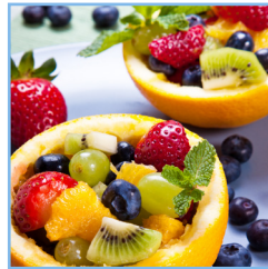
Fruit Apple Orchard® Berry Citrus Grove Mango Martinique Orange Perfectly Peach Sweet Sunsation™