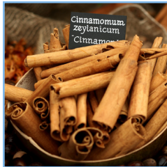
Spice Apple Spice French Vanilla Lemon Drop Cookie Spiced Apple Pie Wild Berry Spice