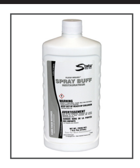
Spray Buff Spray -On Buff and Burnish Maintainer