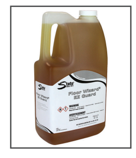
Floor Wizard™ EZ Guard High-Speed Burnish Restorer and Maintainer