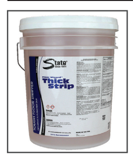
Thick Strip Thickened Gel Heavy-Duty Finish Remover