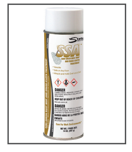
SSA™ Aerosol Dust Mop Treatment