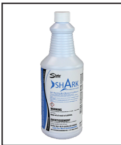
Shark™ Safe Handling Acid Replacement Kleaner