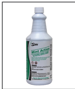
Mint Action™ Bowl and Urinal Cleaner