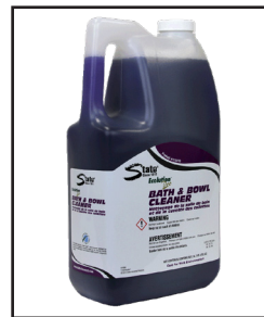
Ecolution Pro® Bathroom & Bowl Cleaner Green Seal® Certified Bathroom Cleaner