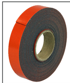
Make-A-Bond™ Double-Sided Adhesive