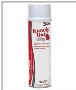
Knock Out™ Aerosol Graffiti and Soil Remover