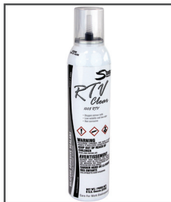
RTV™ Silicone Adhesive/Sealant/ Caulk/Gasket Marker